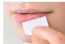
Smart drug delivery – through the skin or into the skin